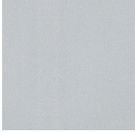
Sparkling Silver - 01 (SSR)