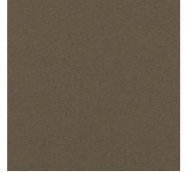
Ancient Bronze - 28 (ABZ)